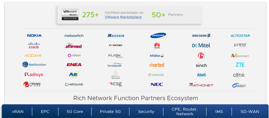
FIGURE 2: The VMware Ready for Telco Cloud program includes a wide variety of certified network functions from over 50 partners.

functions by using VMware Telco Cloud Automation. The onboarding guide for partners can be found as part of the program documentation on the Technology Partner Hub.